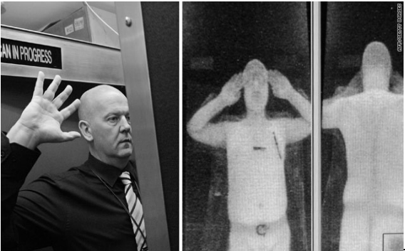
A new body scanner is tested by an employee of Manchester Airport, UK.